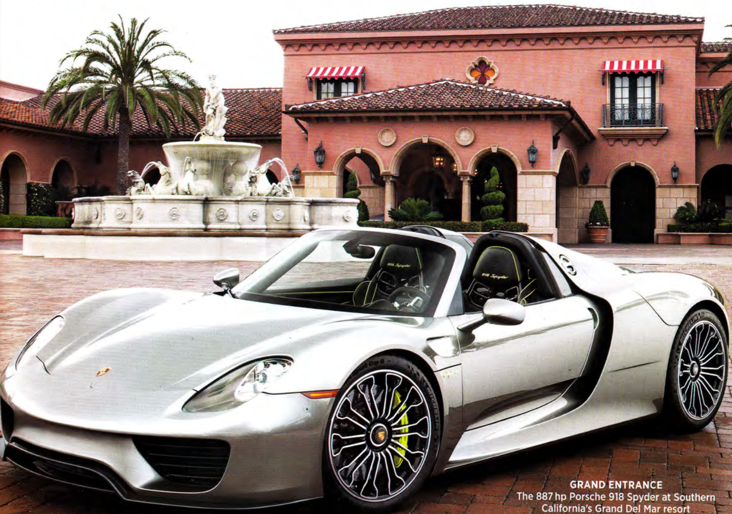
GRAND ENTRANCE The 887 hp Porsche 918 Spyder at Southern California's Grand Del Mar resort

ANGUILLA | BOTSWANA | MALDIVES | MONTANA | PATAGONIA & MORE